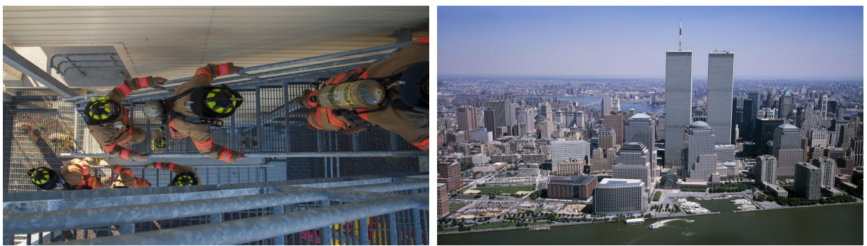
Citations: https://en.wikipedia.org/wiki/File:Twin_Towers-NYC.jpg & https://www.minot.af.mil/News/Article-Display/Article/940943/minot-afb-fire-department-honors-911/

On September 11, 2018 firefighters across Texas honored the 343 firefighters who lost their lives in New York City by climbing tall buildings in full gear. Since these 343 heroes could not complete the climb of the World Trade Center on that day, these firefighters metaphorically finish the climb those heroes started.